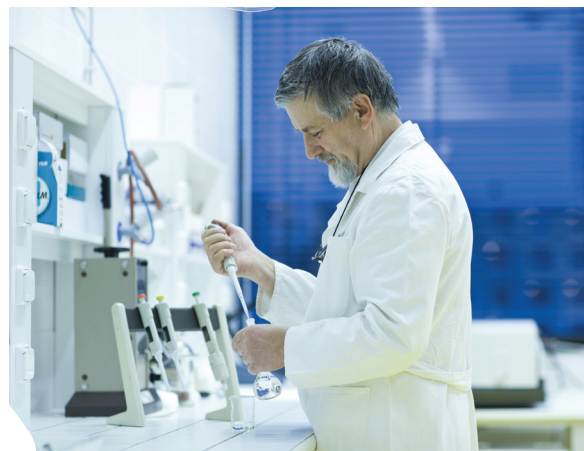
Chemistry that drives innovation